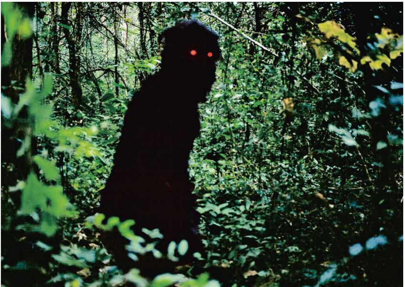
Ghost in the woods: Filmstill from “Uncle Boonmee Who Can Recall His Past Lives”

This encounter of the non-modern with the modern, the past with the present, and the rural with the urban also stood at the center of the first panel “Urbanity, Nature, Modernity.” It began with a screening of “Ugetsu monogatari” (J1953), a folktale-like movie by Kenji Mizoguchi based on an 18th century novel by Ueda Akinari. Its story develops during the 16th century Japanese civil war, where the potter Tobei leaves his village in favor of easy pickings in a nearby town. He is temporarily tricked by the evil fox spirit of a