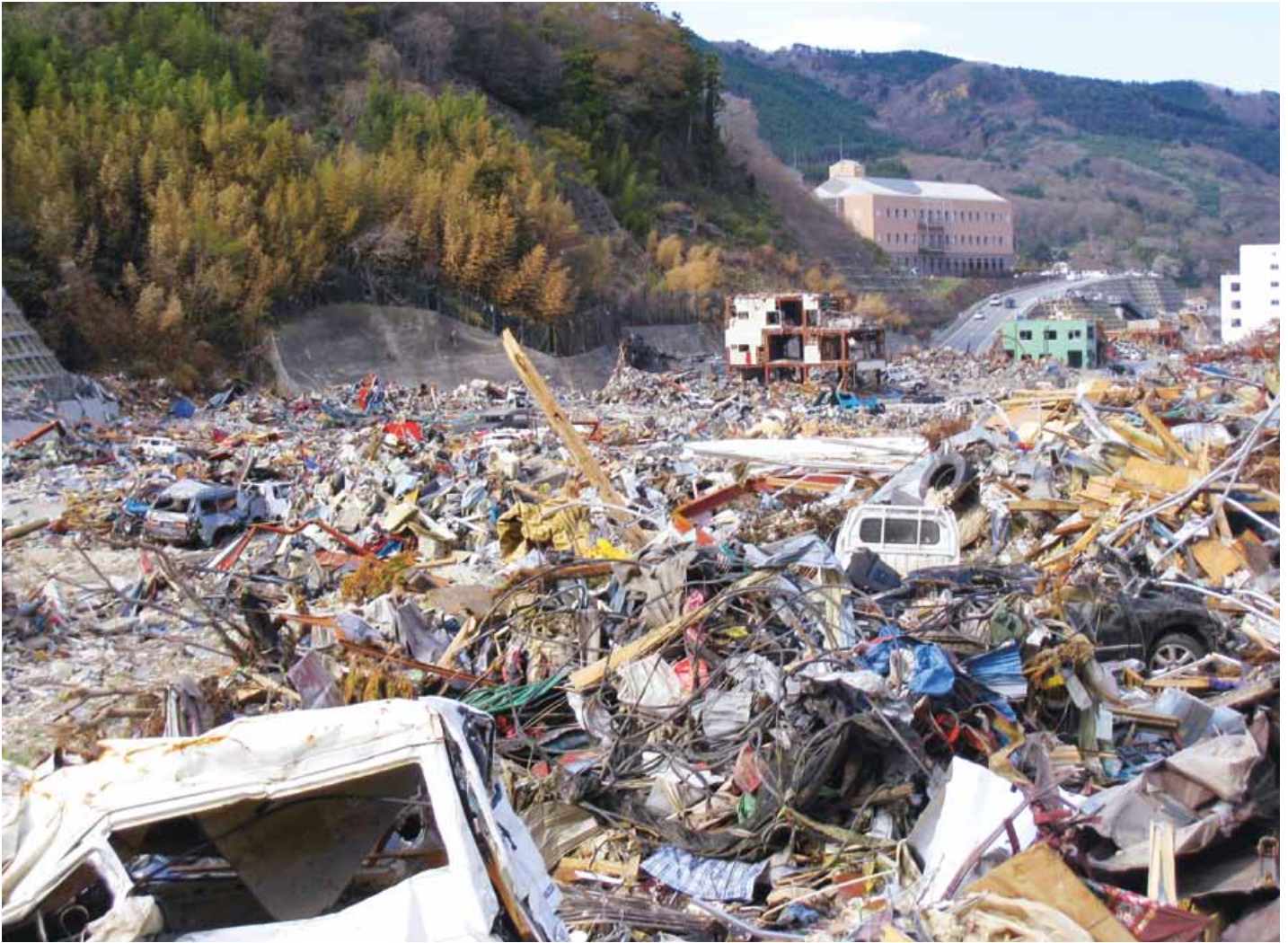
Devastation after the tsunami disaster on March 11, 2011: Ruins and car wrecks in the town of Onagawa (Miyagi prefecture)

scholar, became a professor in Harvard University's department of English Literature, which had theretofore been occupied almost exclusively by American Anglo-Saxon professors. Around the same time, Edward Said of Columbia University passed away. However, Said's promotion of postcolonial studies along with Bhabha and Gayatri Spivak helped to bring these studies to the forefront of American academia. They succeeded in making it possible for non-Western scholars to speak out as theoretical intellectuals before a Western audience. Western scholars do not occupy all theories, though a number of conservative scholars continue to operate under the influence of the Western theorist/native informant dichotomy. Said explains the transplantation of theory in terms of "traveling theories:"