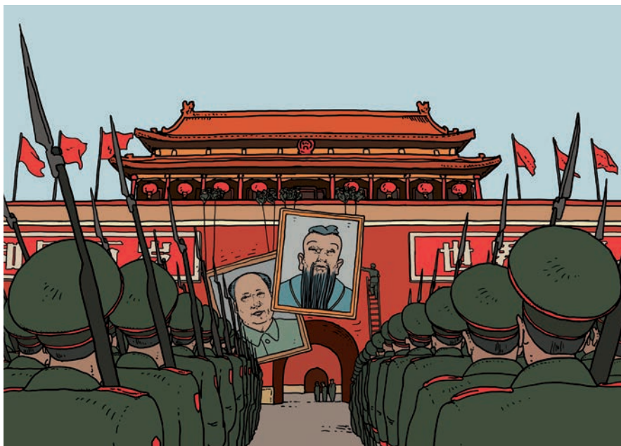
Will Confucius inherit the ideological role of Mao Zedong in the future?

A fascinating workshop on “The Chinese Communist Party and the Politicization of Traditions” took place at the University of Zurich, 6–8 June 2013. It facilitated exchange between political scientists, East Asian studies specialists and China observers to reach a fuller understanding on what, why, and how traditions are communicated and politicized today by the Chinese Communist Party (CCP).