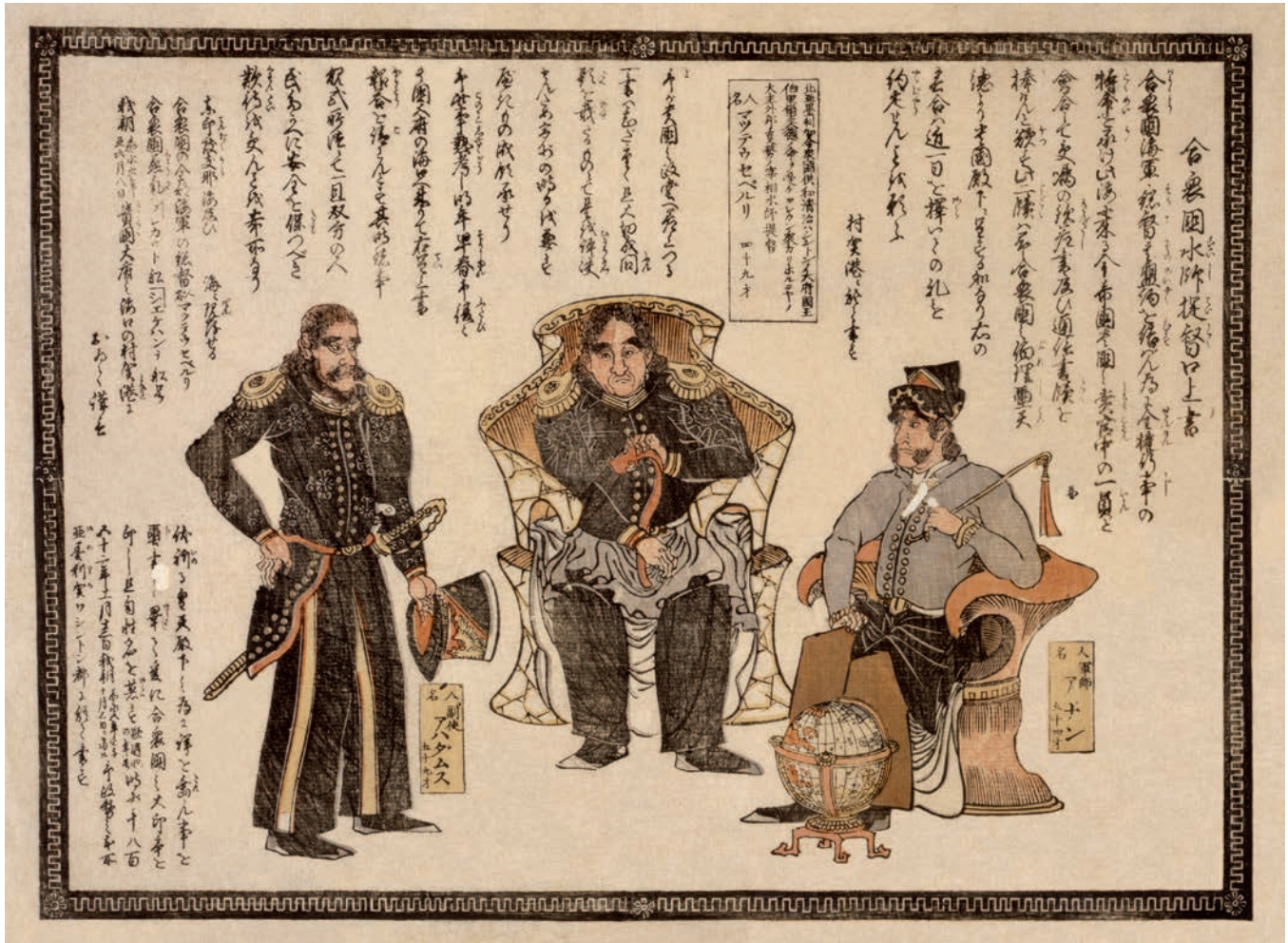
A Japanese print showing three navy officers, believed to be Commodore Perry (in the middle) and two of his staff members

Meiji era. This approach helped us to avoid privileging too much the transformative impact of Western-style technologies and media—the modern newspaper in this case—while giving due credit to the importance of institutions, including the political ones that allowed—and prohibited—different types of public discourse. The same sensibility helped us to make sense of broad issues, such as problems of historical periodization and the nature of international law, as well as very narrow ones, such as whether modernization demanded burial or cremation to deal with the remains of the dead and the relationship between women’s hairstyles and the Japanese embrace of modernity.