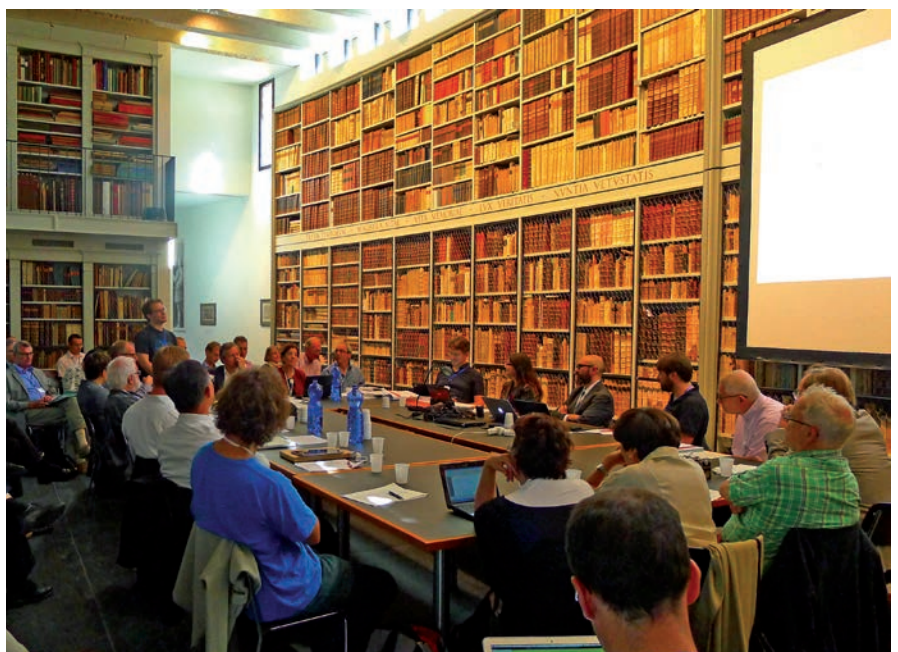
A perfect spot to talk about texts: The reading room of the Oechslin Library in Einsiedeln