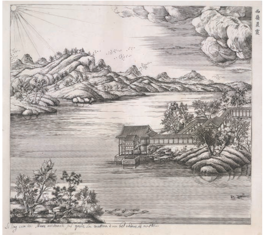
A Chinese landscape adopted by a European artist: Matteo Ripa's engraving "Morning Glow on the Western Ridge" (1711–1713) after a drawing by Shen Yu (d. ca. 1727).

Session Three, "Circulation of Landscapes," brought together papers that engaged with the materials,