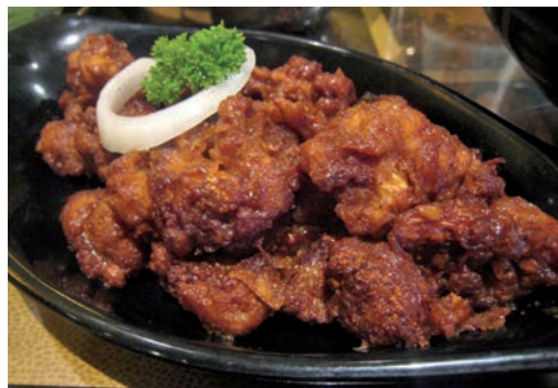
Gobi Manchurian: a vegetarian 'interpretation' of Gulao rou

it, if one believes the various filmed versions of preparations posted on Youtube where the cooks are all Indian. But there still remains the mystery of its designation. What has Manchuria to do with the Chinese people of Canton, since this designation cannot be of Indian origin? After a superficial survey of the question, I noticed the existence of a number of restaurants called "Manchurian" or "Manchuria" in several English-speaking countries, establishments often run by Cantonese people and offering Cantonese or northeastern Chinese cuisine. Therefore one could hypothesize that in this sphere that arose from or close to the former British colonial empire, this term reflects some sort of blurred 'Chinese-ness' and thus evokes the high reputation of a great Chinese culinary tradition, guaranteeing the quality of these restaurants.