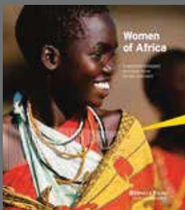
Women of Africa: A powerful untapped economic force for the continent