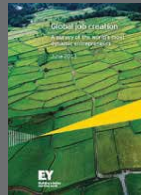
Global job creation surveys