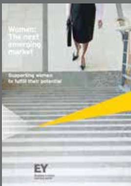
Women: The next emerging market