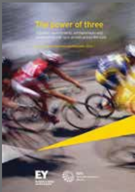
The EY G20 Entrepreneurship Barometer series