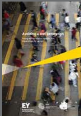
Avoiding a lost generation