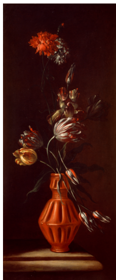
Andrea Belvedere, Búcaro with Flowers , c. 1670–80, oil on canvas, 89 × 40 cm, Museo di Capodimonte, Naples

Nora Guggenbühler nora.guggenbuehler@uzh.ch