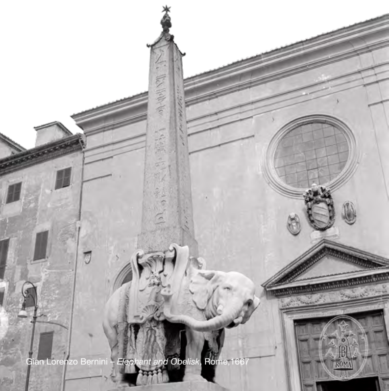
Gian Lorenzo Bernini – Elephant and Obelisk , Rome, 1667