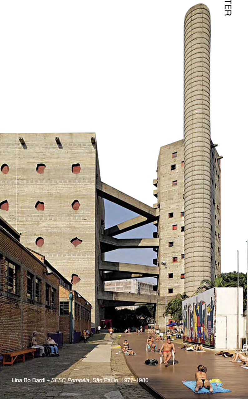
Lina Bo Bardi – SESC Pompéia, São Paulo, 1977–1986