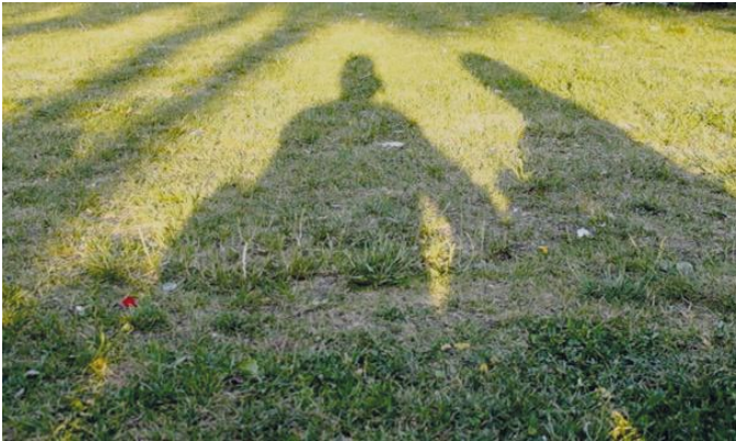
Napps – Memoire of an Invisible Man