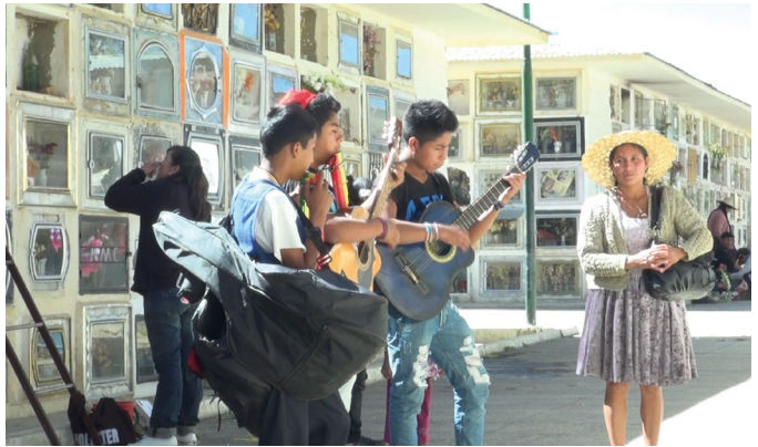
Trabajar es Crecer / To Work is to Grow