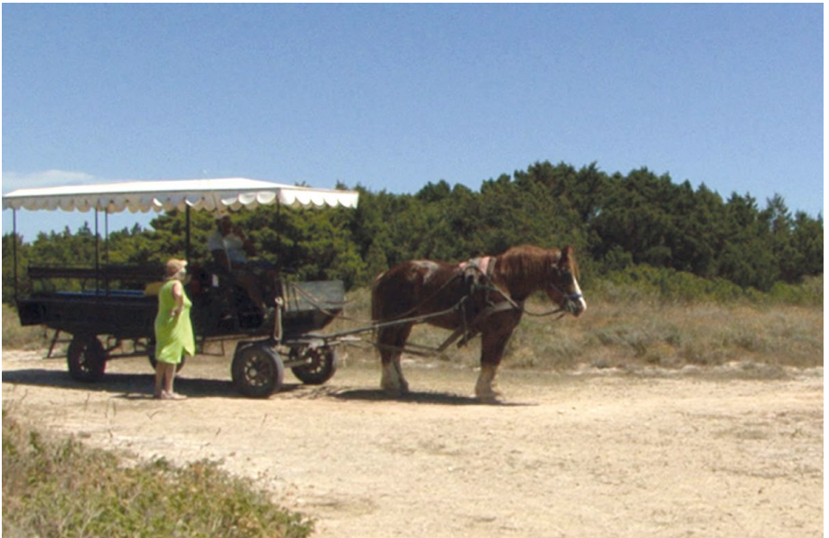
Encounters on Pianosa