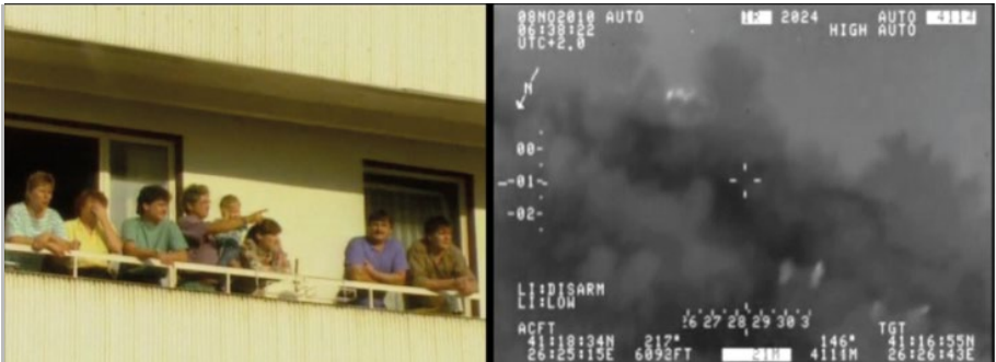
Dokument Hoyerswerda | Frontex