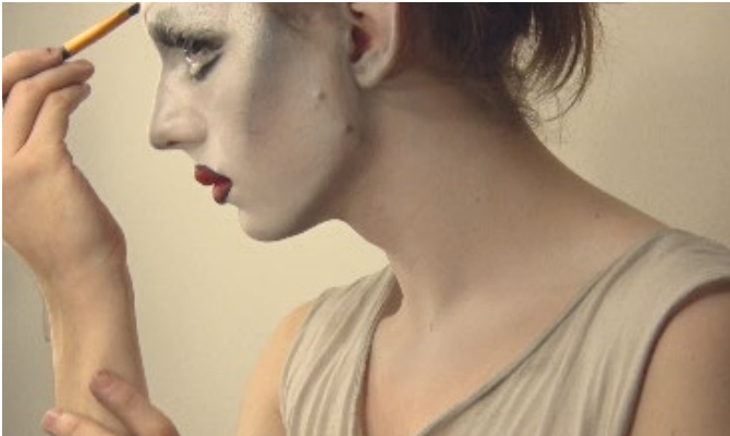
Becoming Liquorice Black