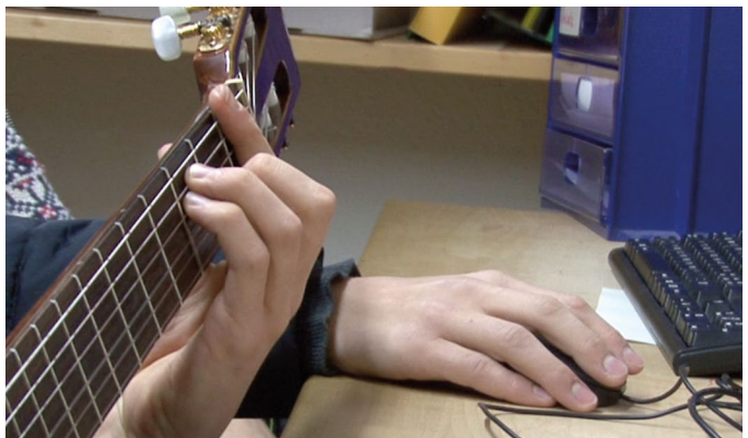
Is it Lonely at the Top?