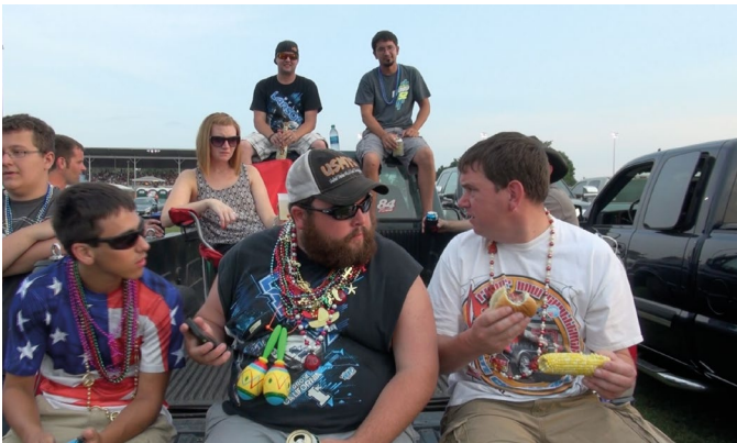
I'm not Leaving Eldon